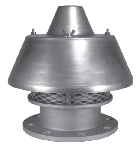
Figure 1. Rim Vent Pressure Relief Valve

Failure to correct trouble could result in a hazardous condition. Call a qualified service person to service the unit. Installation, operation and maintenance procedures performed by unqualified person may result in improper adjustment and unsafe operation. Either condition may result in equipment damage or personal injury. Only a qualified person must install or service the pressure relief valve.